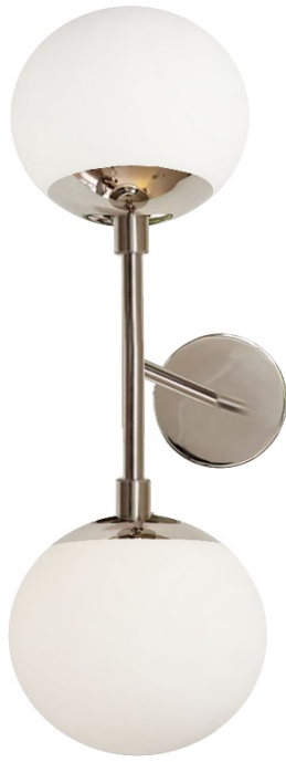
2 Light Halogen Polished Chrome Wall Sconce w/ White Glass